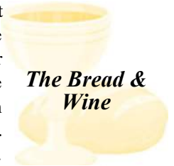
The Bread & Wine

If you wish to participate in the ancient tradition of providing the bread and wine for our liturgies as a memorial for your family or your deceased loved ones, please notify the rectory or drop an envelope with your offering in the collection basket. $10.00 offering is requested.